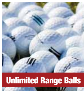
Unlimited Range Balls