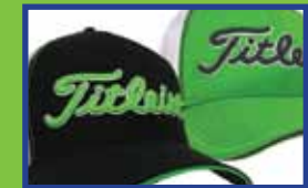
Titleist Golf Hat