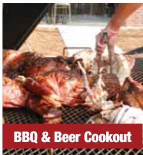
BBQ & Beer Cookout