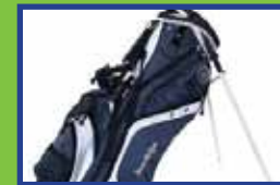
Tour Edge Bag