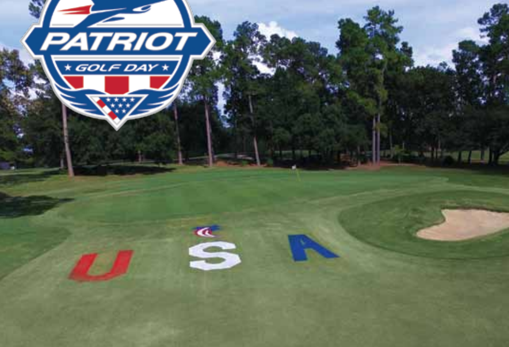
Lake Marion Golf Course Fully Decorated for Patriot Golf Day