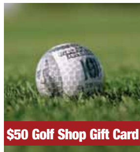
$50 Golf Shop Gift Card