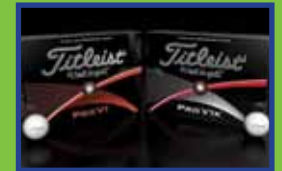
Titleist Pro V1s