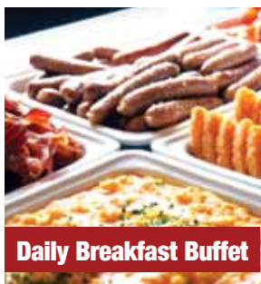
Daily Breakfast Buffet